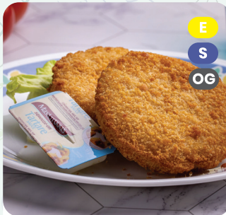
Salmon and Veggie Patties