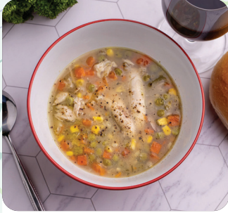
Chicken and Vegetable