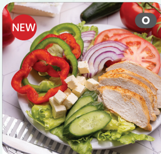
Chicken Breast and Feta Salad