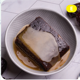
Sticky Date Pudding