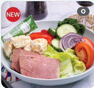
Silverside and Potato Salad