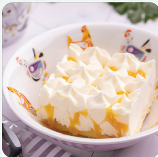
Peach and Mango Cheesecake