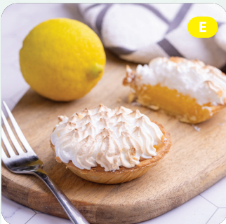
Lemon Meringue Pie