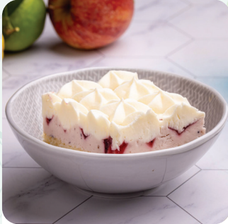
Berry Cream Cheesecake