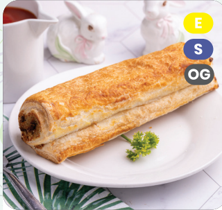
Jumbo Sausage Roll