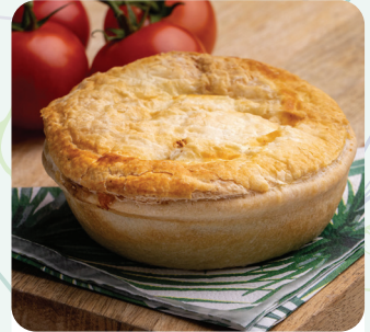
Steak, Bacon and Cheese Pie