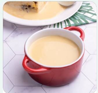
Butterscotch Sauce Tub